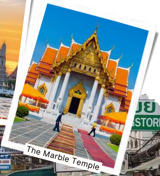
The Marble Temple